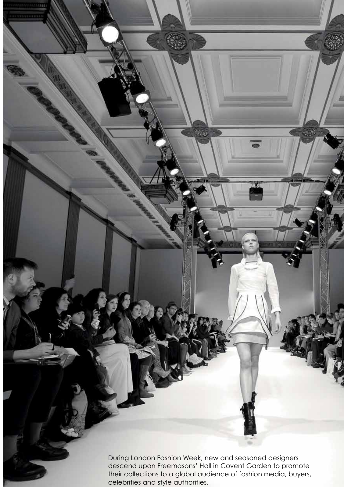
During London Fashion Week, new and seasoned designers descend upon Freemasons' Hall in Covent Garden to promote their collections to a global audience of fashion media, buyers, celebrities and style authorities.