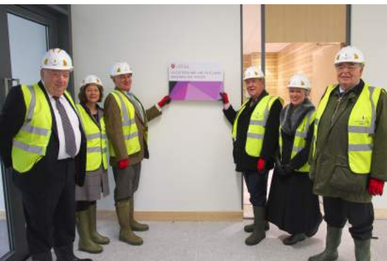
Leicester University Centre for Medicine - £50,000