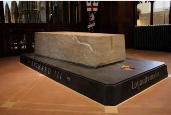
Richard III Reinterment at Leicester Cathedral - £15,000