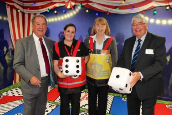
Warning Zone - E-Safety Zone - £10,000